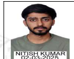
NITISH KUMAR 02-03-2025